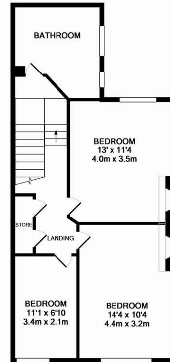
1ST FLOOR APPROX. FLOOR AREA 561 SQ.FT. (52.1 SQ.M.)